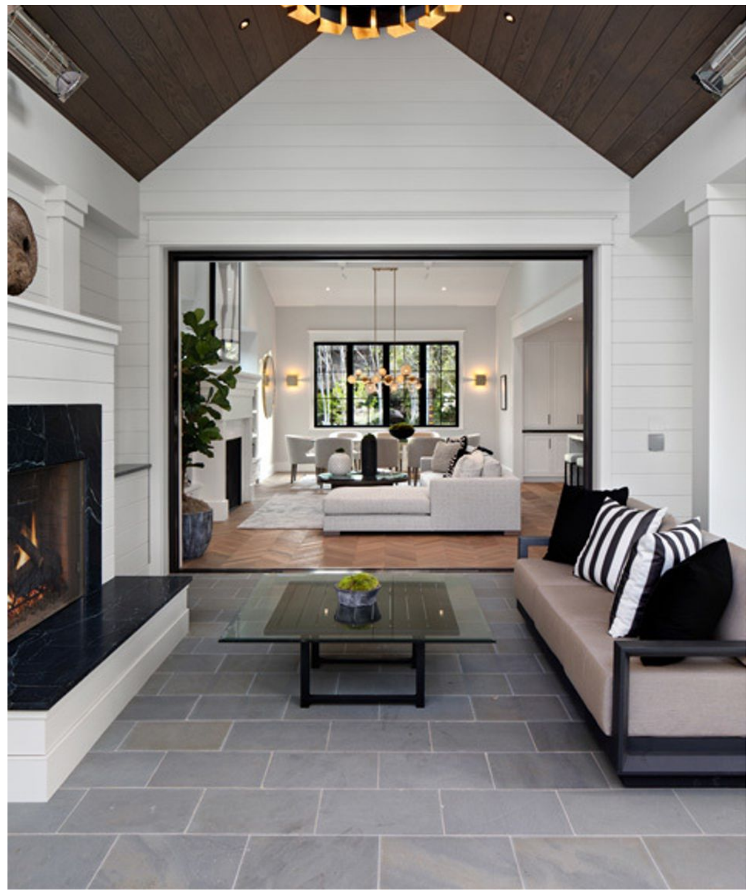
The glass doors in the great room can fully pocket into the walls to reveal the back porch. Bernard Andre